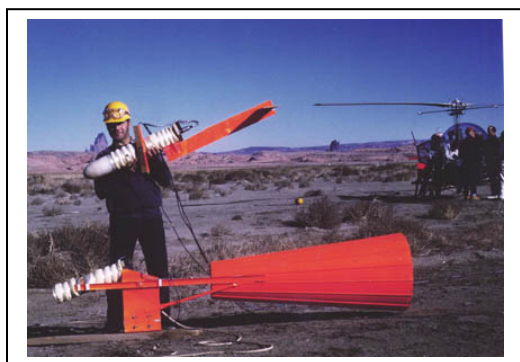
The first airborne test of the rubidium magnetometer- gradiometer in Monument Valley, Arizona - part of Breiner's Master's research project at Stanford.

"Soon it was time to put the magnetometer to new uses. I measured the electric currents of the human heart and brain, mounted it on a gun-sniffing dog to verify his findings, tracked migratory animals such as sea turtles, measured the effect of a nuclear detonation thousands of miles away, and studied its possible applications on satellites. I guess that imagination was the only limiting factor to what could be done with that instrument."